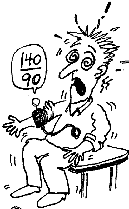
② High Blood Pressure