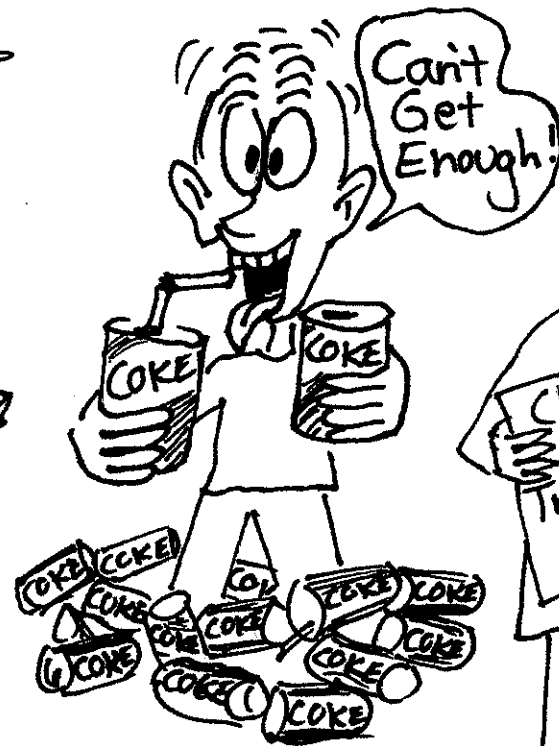
④ High Cholesterol and Triglycerides.